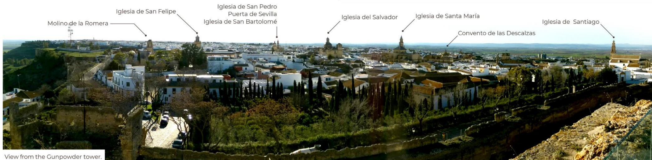
View from the Gunpowder tower.